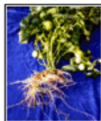
Tomatoes! Untreated plants