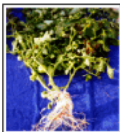
Treated - 5 tons more per acre!

Bio-Gard Agronomics, Inc. P.O. Box 4477 Falls Church, VA 22044 U.S.A.